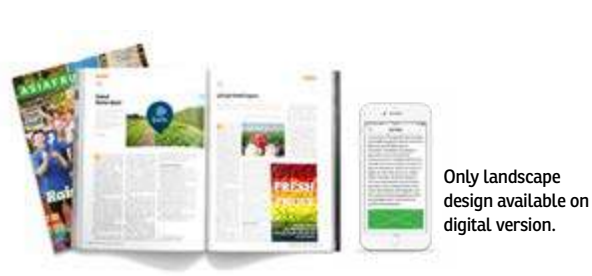
Vertical advert - 71mm x 127mm*